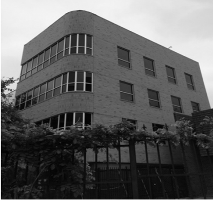
New ABOG Building - 5237 square feet